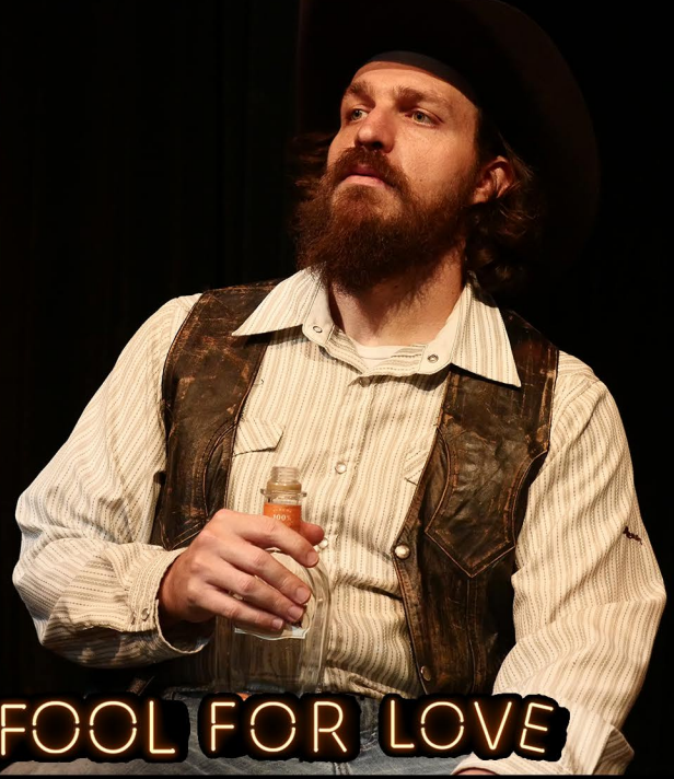
FOOL FOR LOVE