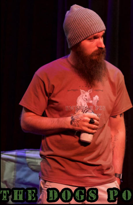
THE DOGS POND