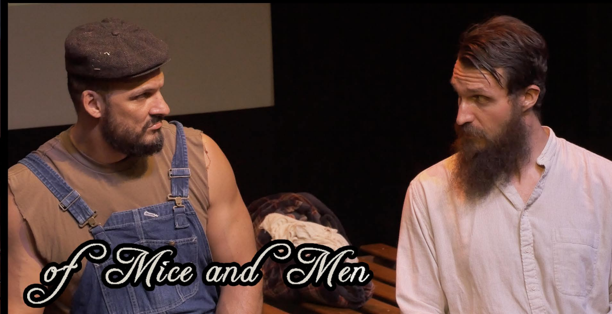
Of Mice and Men